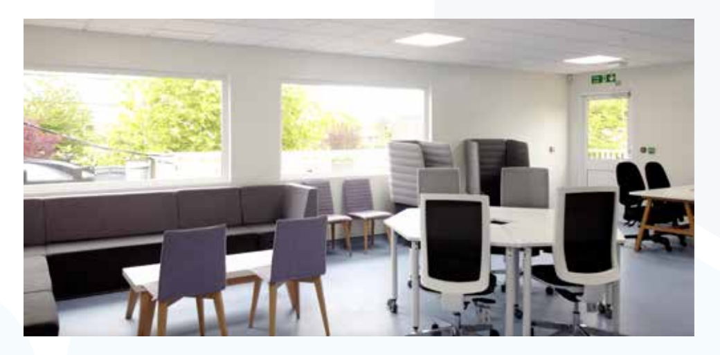
Figure 2. The staff wellbeing area in the modular theatre hub at Queen Mary's Hospital, St George's University Hospitals NHS Foundation Trust, London.