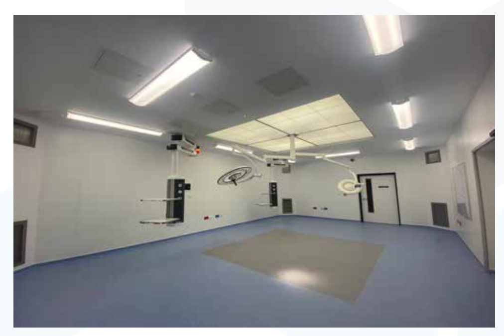
Figure 3. Interior view of a bespoke, modular surgical theatre, as delivered by the supplier.

commented favourably on the amount of natural light let into the modular units compared to the main building. In interviews with staff members, one manager who worked across multiple sites states that the hospital's modular unit was the only facility about which they had never had a complaint about comfort.