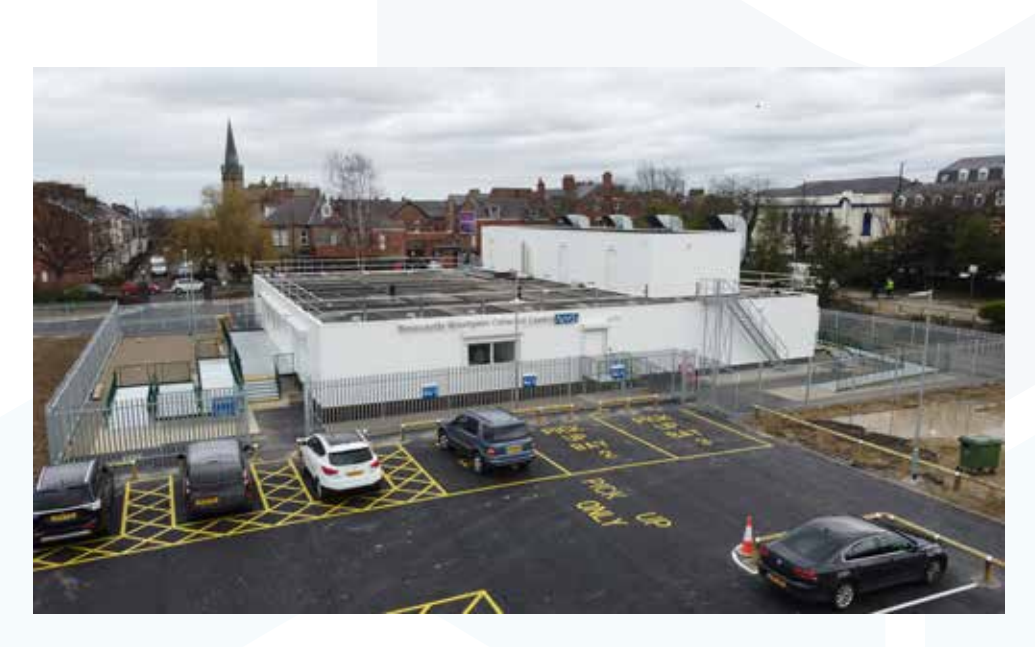
Figure 3. Exterior of the Newcastle Westgate Cataract Centre at Newcastle upon Tyne Hospitals NHS Foundation Trust, showing the designated pick-up spot for patients, the patient entrance to the south of the building (left) and exit at the north of the building (right).

However, the provider was able to incorporate these changes into the design as installation took place to ensure that the final building was optimal for staff.