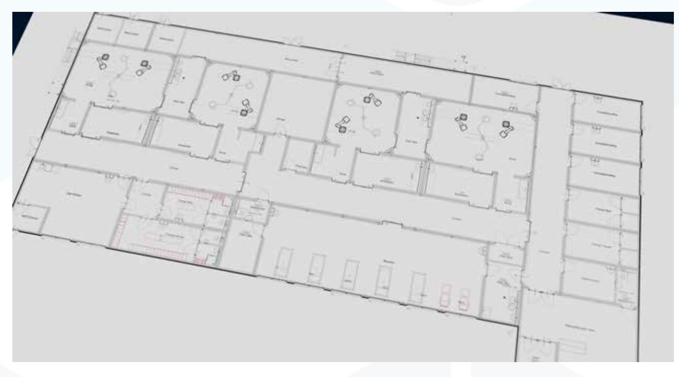
Figure 2. Floorplan of the modular surgical hub at Queen Mary's Hospital in south-west London, providing optimal space to implement the Royal College of Surgeon's (2021) 'new deal for surgery'.

Similarly, the Department of Health (2014a, b) has placed a significant emphasis on the need to increase the efficiency of the NHS estate, both in terms of energy use and the streamlining of services. They stated that cost savings and increased efficiency could be achieved by the provision of a healthcare workplace that enables productivity and collaboration between teams, but highlighted that this is likely to require an initial investment, if the solution is to be adequate. Increasing NHS property resources in this way would be an application of the concept of 'real' investment in healthcare infrastructure (Box 2).