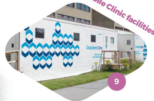
Mobile Clinic facilities

At Peterborough we provided an Ambulance Handover Facility in an undercroft below the hospital main theatres.