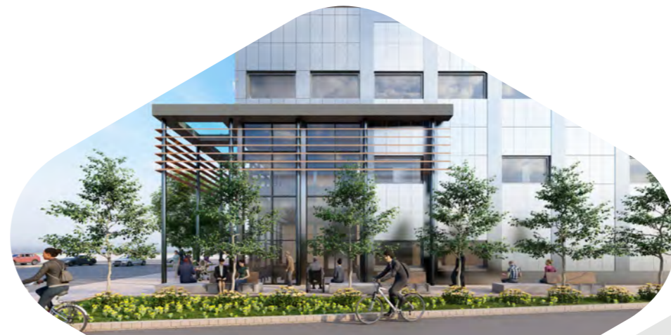
Intensive Care Unit

Away from the hospital, our designs for modular CDCs (Community Diagnostic Centres) can be tailored to customers' requirements.