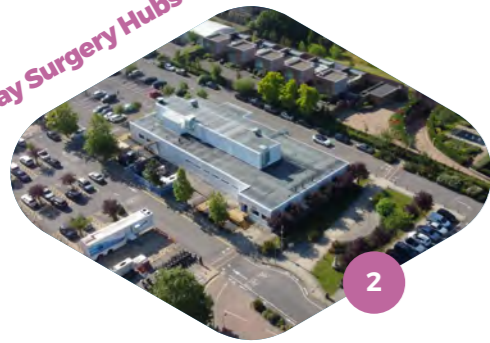
Day Surgery Hubs

With demand increasing, our wide range of mobile and modular facilities provides flexibility to locate endoscopy procedures and/or decontamination on site.