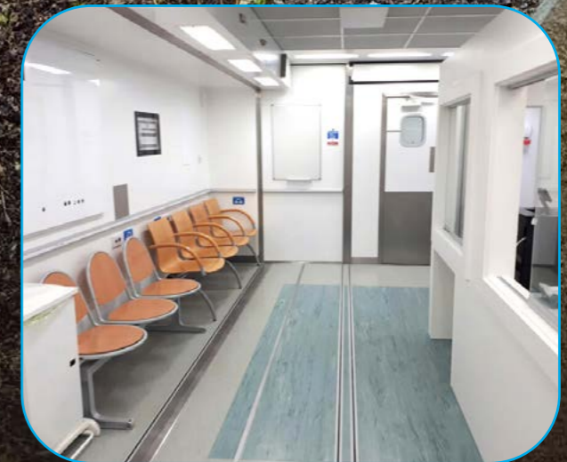
Royal Infirmary of Edinburgh

For more information, please scan the QR code or visit www.vanguardhealthcare.co.uk/temporary-minor-injuries-unit-miu-created-at-nhs-lothian/