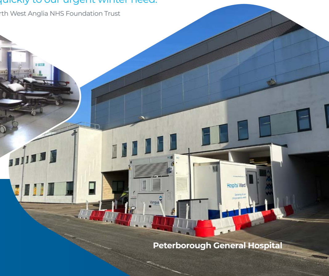
Peterborough General Hospital

For more information, please scan the QR code or visit www.vanguardhealthcare.co.uk/case-study/peterborough-city-hospital-north-west-anglia-nhs-foundation/